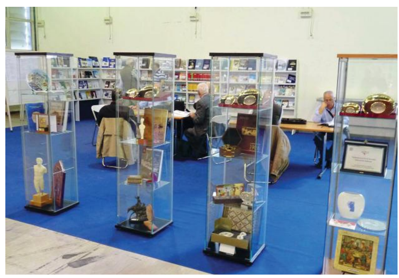
Left, the evaluation of the Literature Class was done at the premises of the Hellenic Philotelic Society. Right: The 127 exhibits of Philatelic Literature were then presented at a specially provided area of the Exhibition Hall, in order to display the richness of philatelic research and the development of philatelic knowledge. In front of the Literature Corner, the Special Prizes.

The Philatelic Literature Supplement is a wonderful catalogue including all relevant details of every item, not to be missed: http://hps.gr/notos2015/philatelic-literature-supplement/