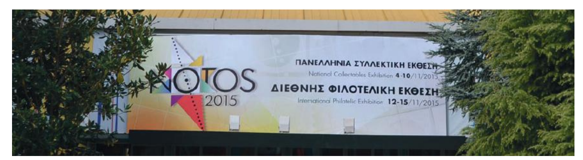
The header at the entrance of the Peristeri Exhibition Center

To achieve it is necessary not only to be very clever, efficient and ready to work extremely hard as they has done, but also a lot of courage to go over such enormous task with such a limited budget, that was not noticed as the quality of all aspects of the exhibition exceeded the international standards. Congratulations!