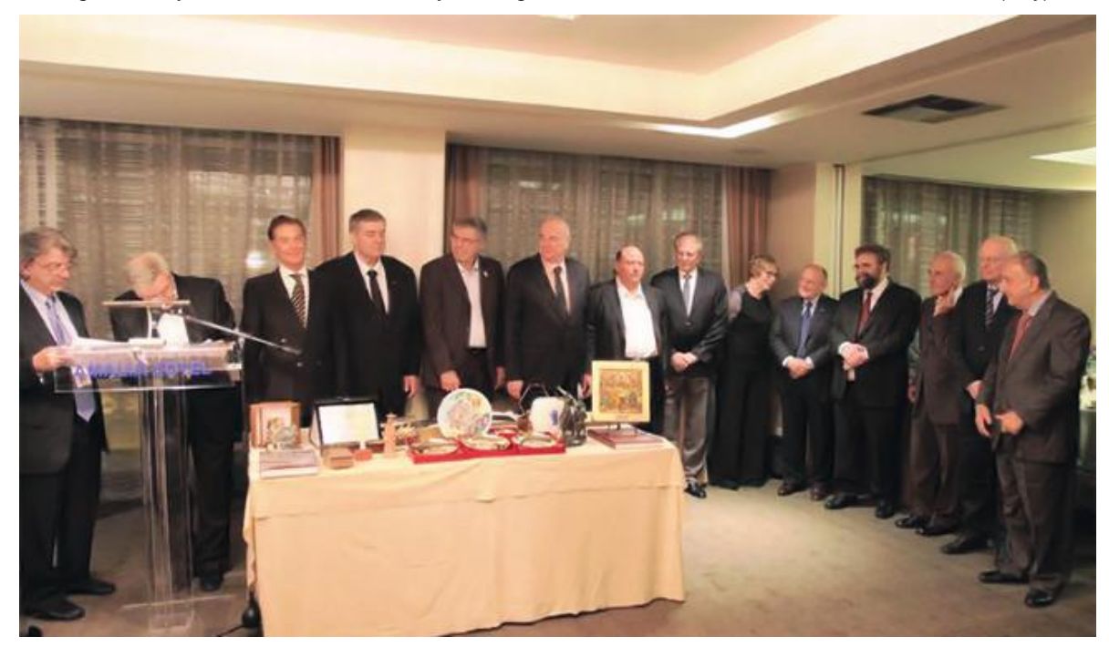
Large Gold winners present at the Palmares.